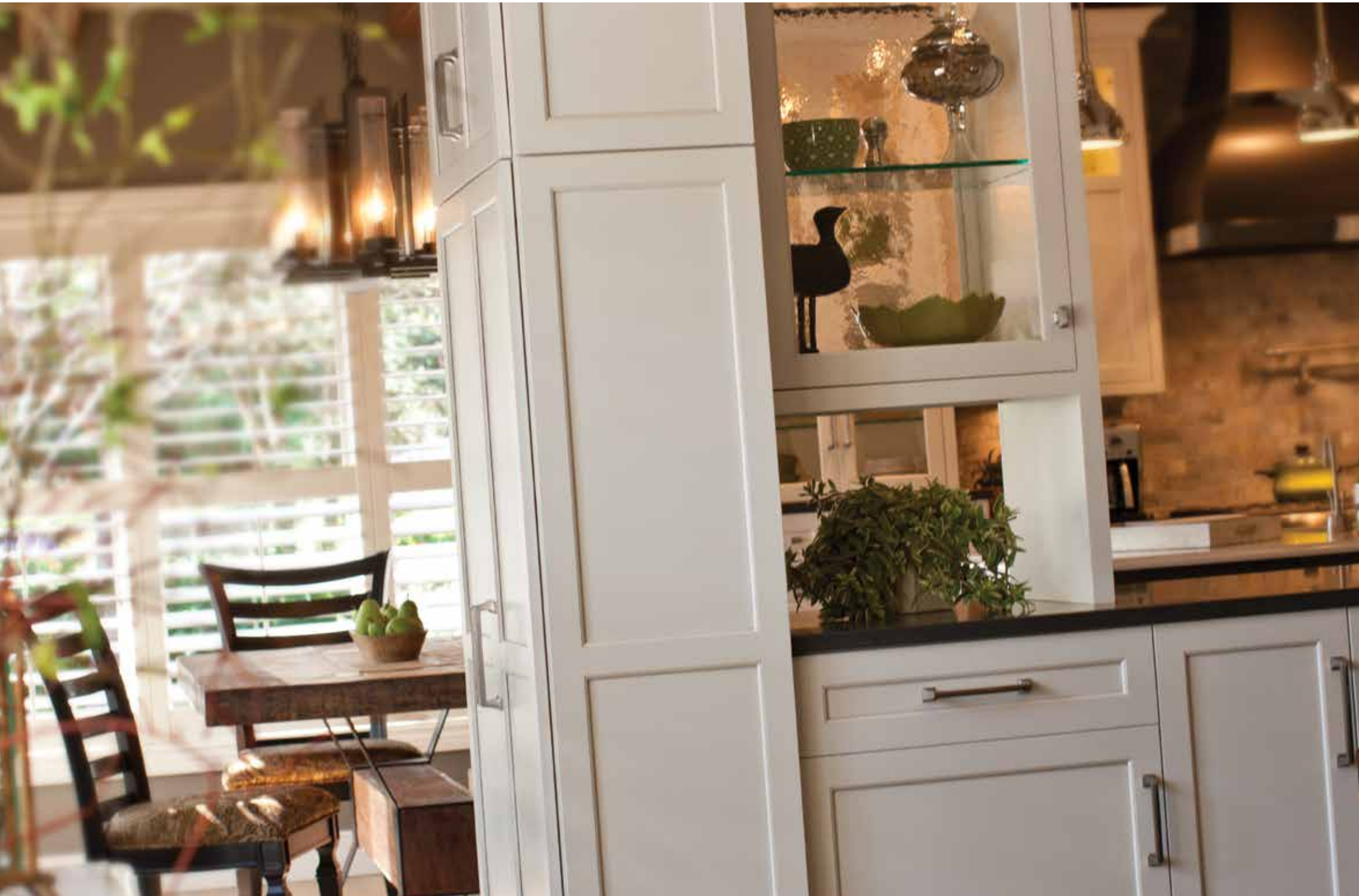
Alectra Cabinetry shown with "Arcadia Panel" door style in Classic White/Pewter Accent finish.