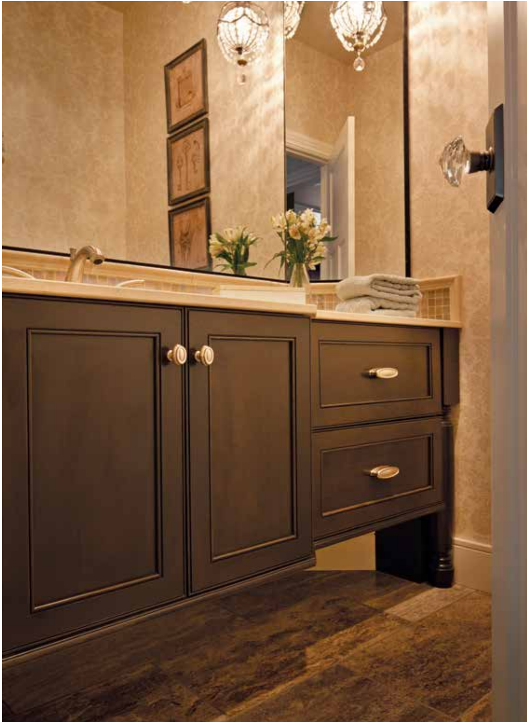
Shown with "Madison" door style in Cherry with Peppercorn finish.