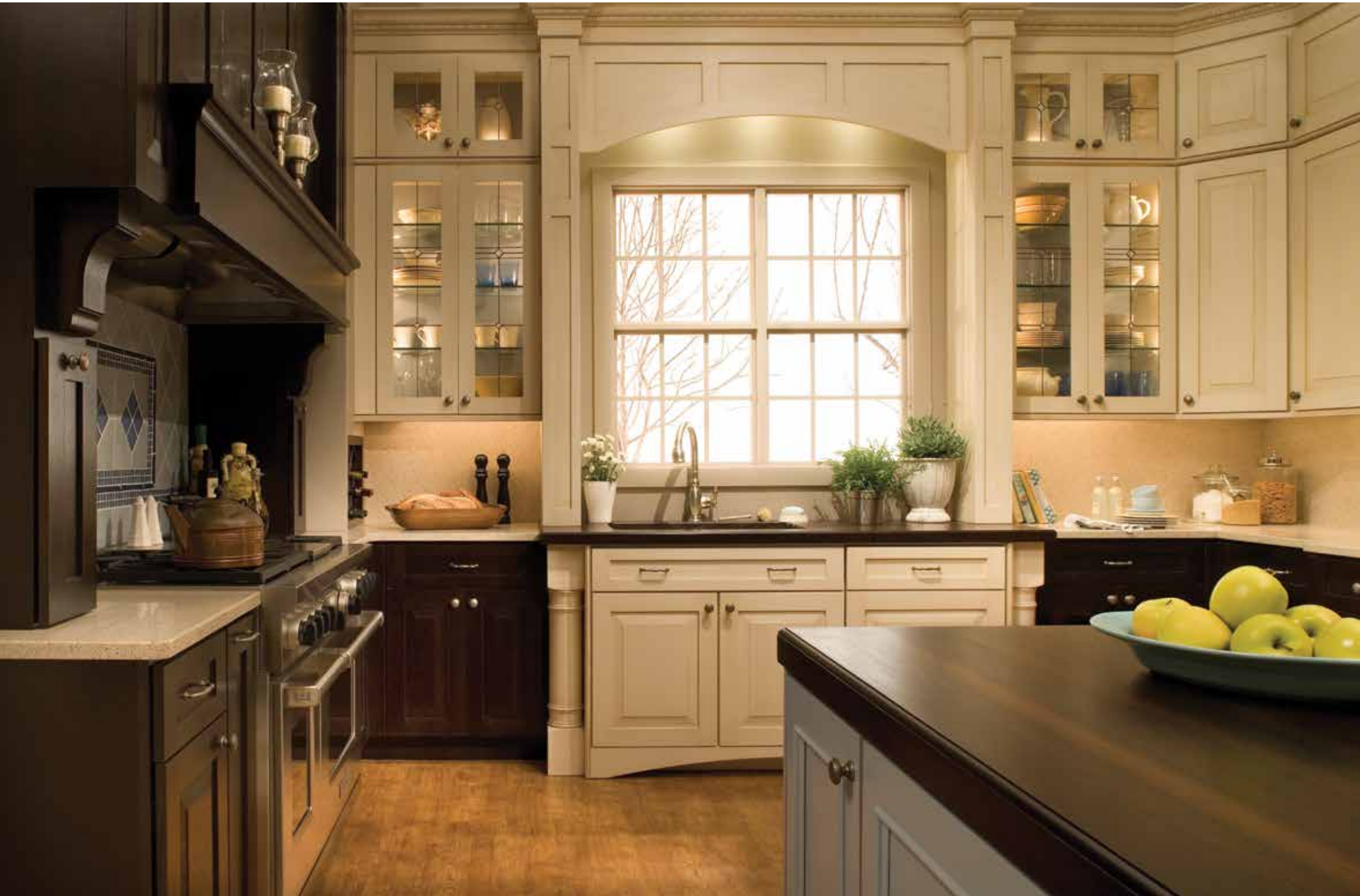
Crestwood Cabinetry with "Lancaster" door style in Maple with Antique White/Espresso Glaze and Quarter-Sawn Oak with Cocoa Brown. Island has "Vintage Panel" door in Maple with custom blue paint.