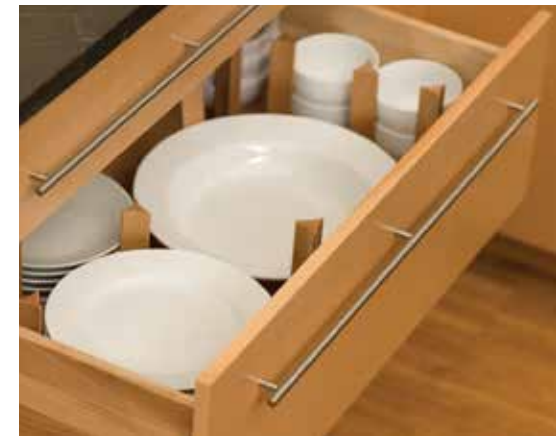
Dish Storage Drawer