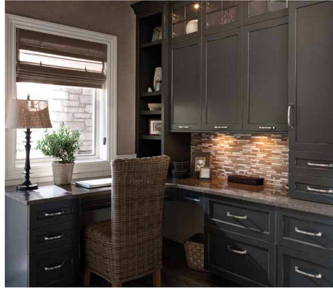
Bria Cabinetry shown with "Arcadia Panel" door style in Maple with Graphite paint finish.

WHY CONFINE CABINETS TO THE KITCHEN? Dura Supreme cabinetry is an intelligent choice for built-in and freestanding furniture pieces throughout your home. As open floor plans gain popularity and kitchen space merges seamlessly with living spaces, it's only natural to extend cabinetry into other areas of the home to create architectural and design consistency. Dura Supreme cabinetry offers an amazing array of door styles, finishes and decorative elements along with superior construction, joinery, quality and custom sizing. Your Dura Supreme dealer can introduce you to a host of intriguing design venues and furniture applications for your entire home.