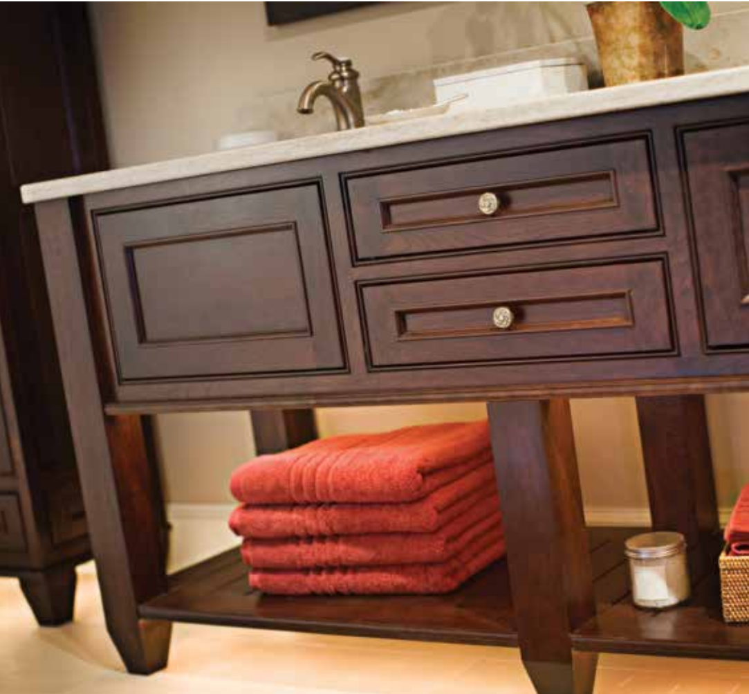
Designer Cabinetry shown in Beaded Inset with "Chapel Hill Panel" door in Cherry with Chestnut finish.