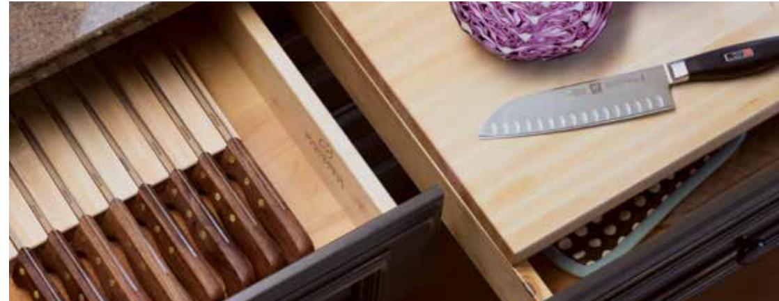
Drawer Knife Holder and Chop Block