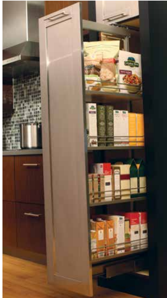
Tall Pull-Out Pantry