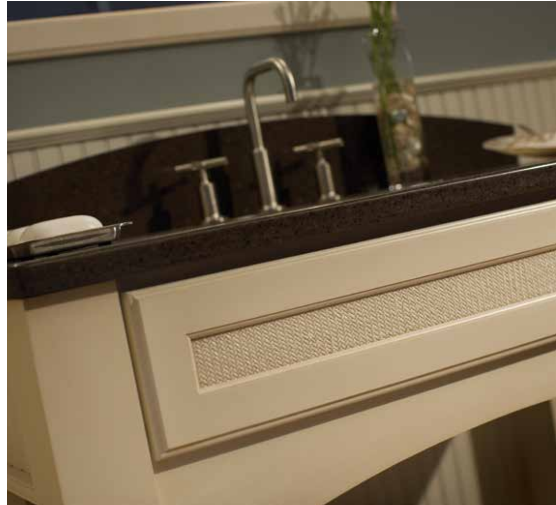
Designer Cabinetry shown with "Arcadia Panel" door style with Rattan insert in Maple with Antique White/Espresso Glaze finish.

THE BATH HAS EVOLVED from its purist utilitarian roots to a more intimate and reflective sanctuary in which to relax and reconnect. A refreshing spa-like environment offers a brisk welcome at the dawning of a new day or a soothing interlude as your day concludes. Bath cabinetry from Dura Supreme offers myriad design directions to create the personal harmony and beauty that are the hallmark of the bath sanctuary. Immerse yourself in our expansive palette of finishes and wood species to discover the look that calms your senses and soothes your soul.