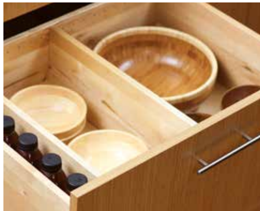
Adjustable Drawer Partitions