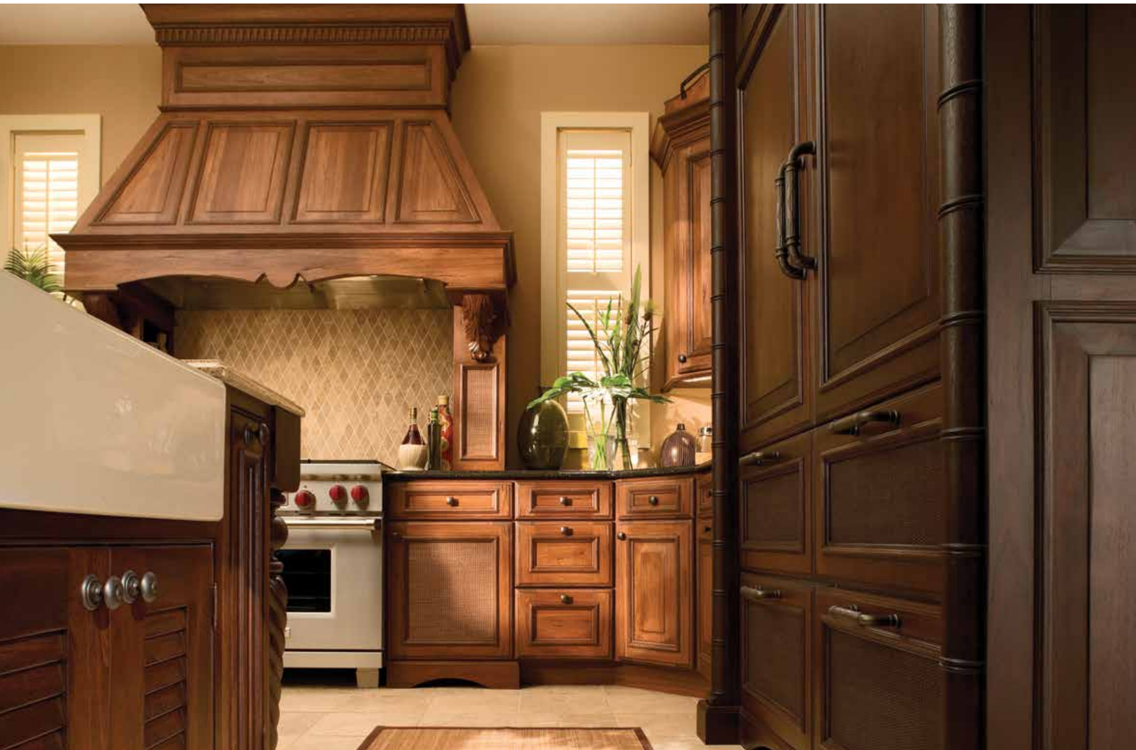
Designer Cabinetry shown with "Sunbury House" door style in Lyptus with Heavy Heirloom "M" finish and Heirloom "C" finish.