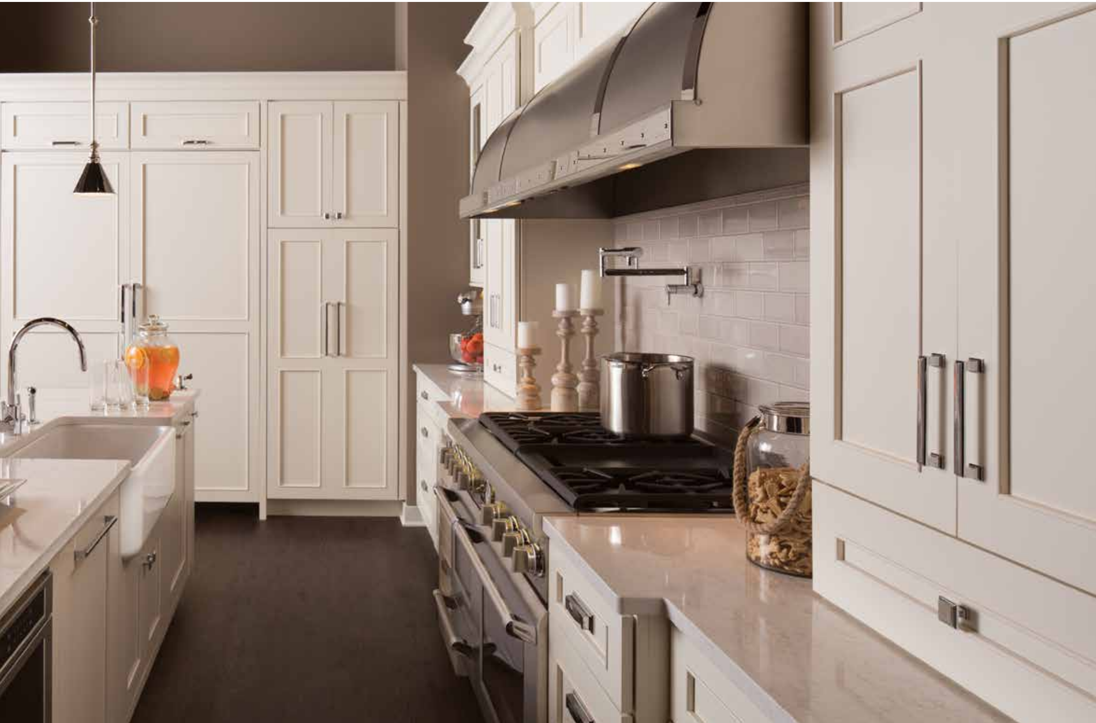
Crestwood Cabinetry shown with "Silverton" door style with Classic White paint.