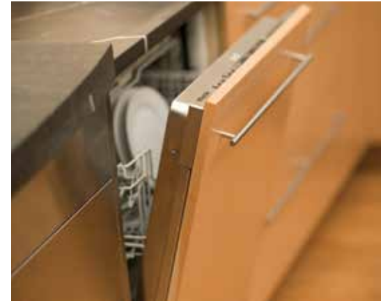
Integrated Dishwasher Panel