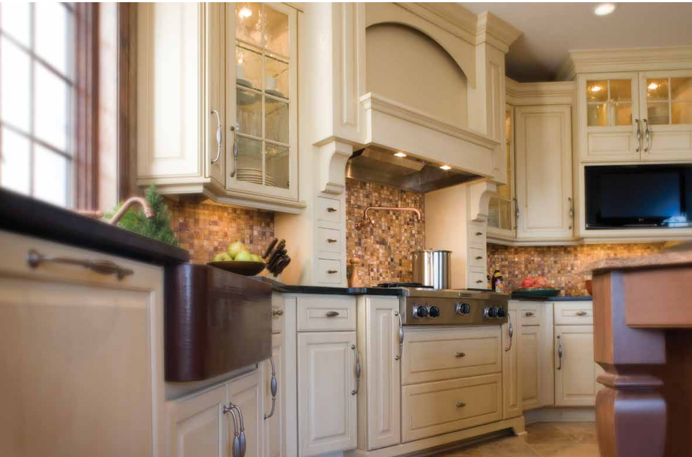
Crestwood Cabinetry shown with "Arcadia Classic" door style in Maple with Latte/Espresso Glaze finish.