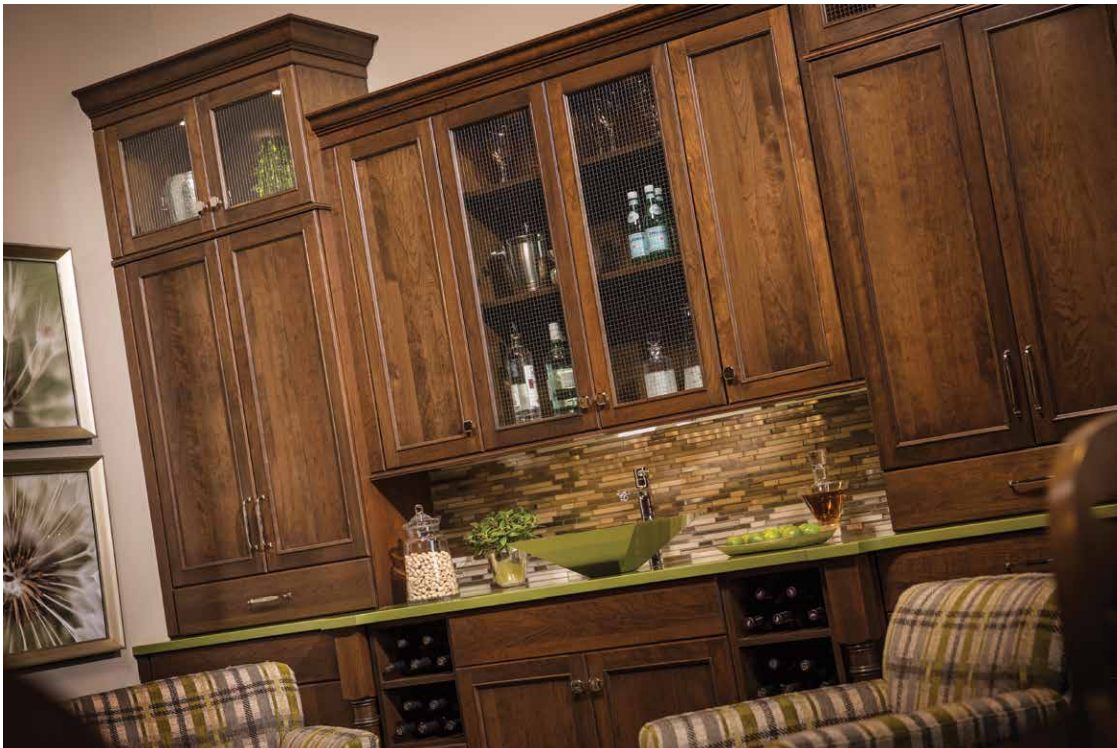
Alectra Cabinetry shown with "Chapel Hill Panel" door style in Cherry with Praline finish.