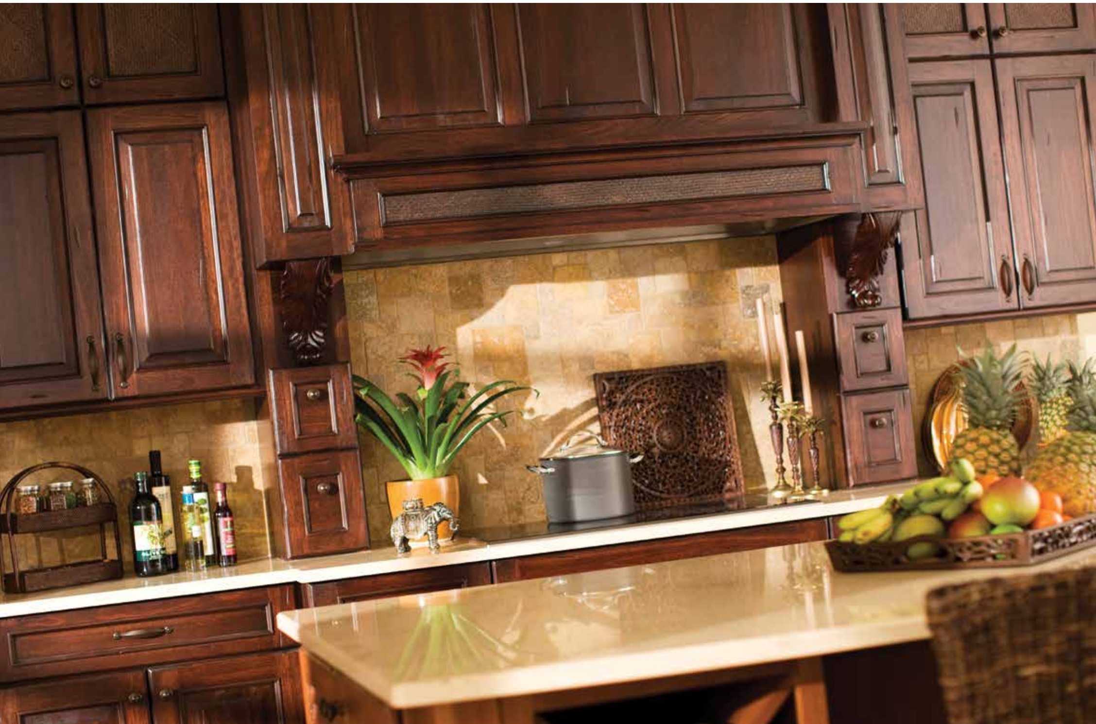
Designer Cabinetry shown with "Montego" door style in Lyptus with Heavy Heirloom "C" finish. Island cabinetry has Heirloom "M" finish.