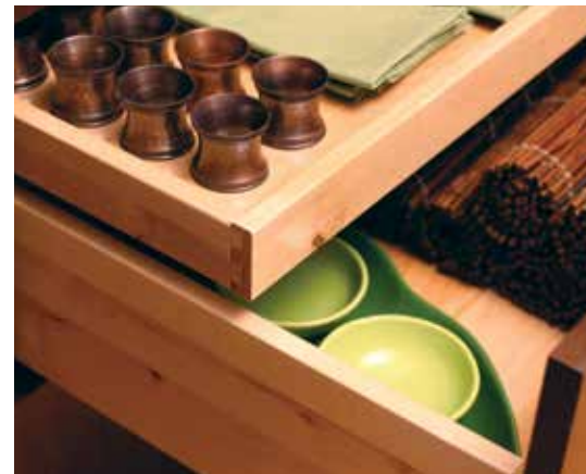
Shallow Roll-Out Above Drawer