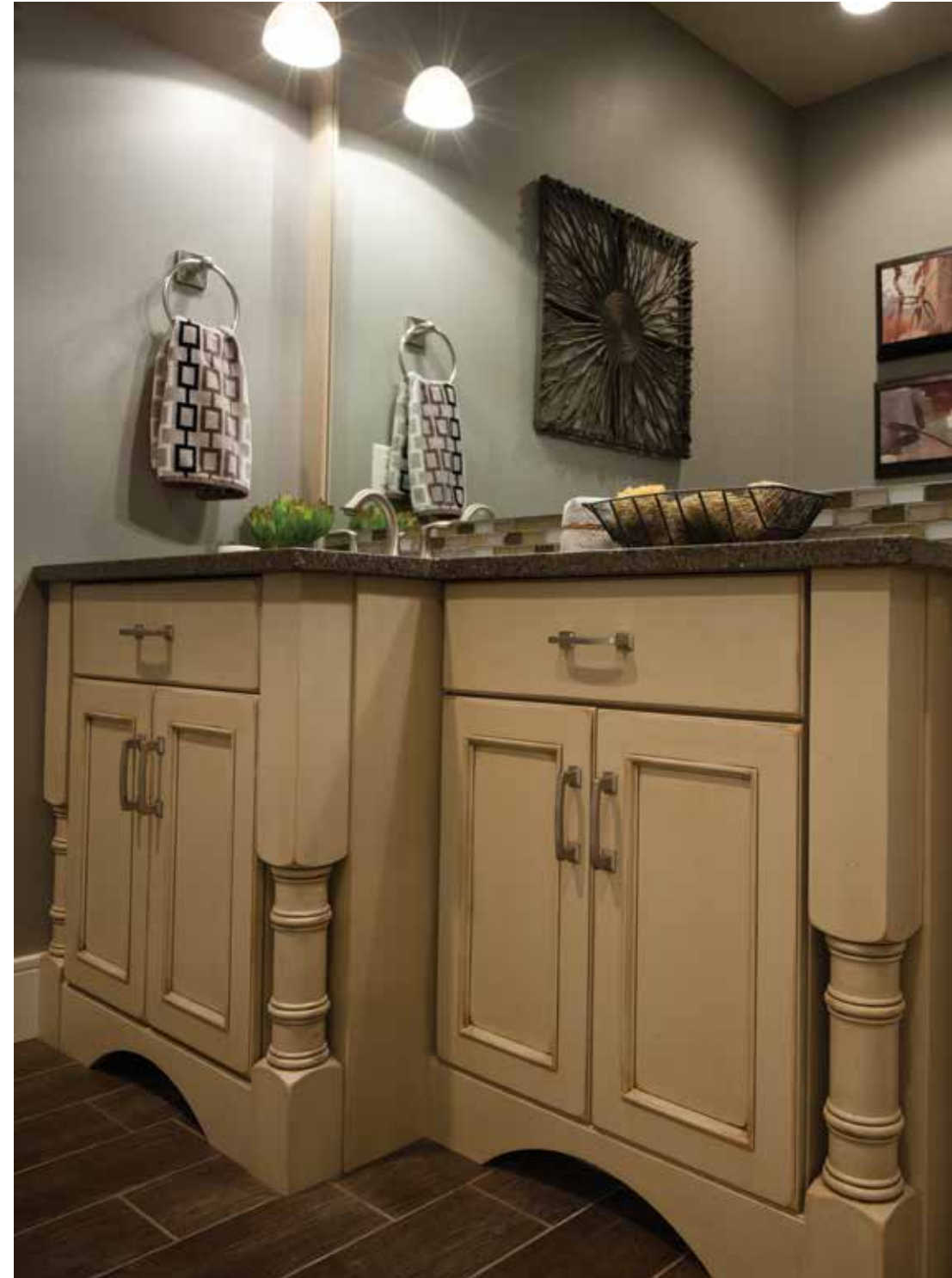
Shown with "Chapel Hill Panel" door style in Maple with Latte/Espresso Glaze and Rub-Thru.