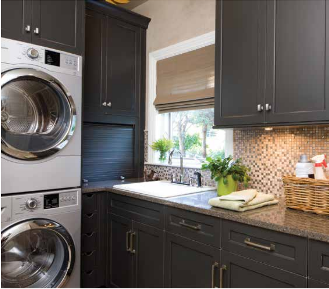
Bria Cabinetry shown with "Arcadia Panel" door style in Maple with Graphite paint finish.