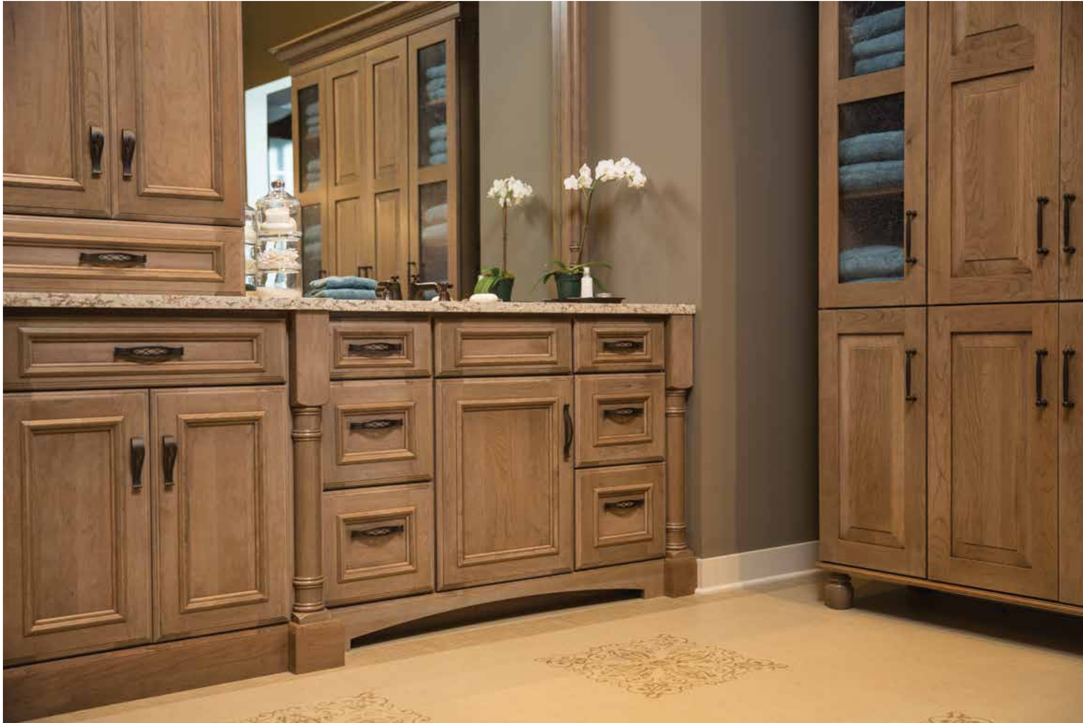
Designer Cabinetry shown with "St. Augustine" door style in Cherry with Cashew finish. Linen cabinetry shown with "Lancaster" door style.