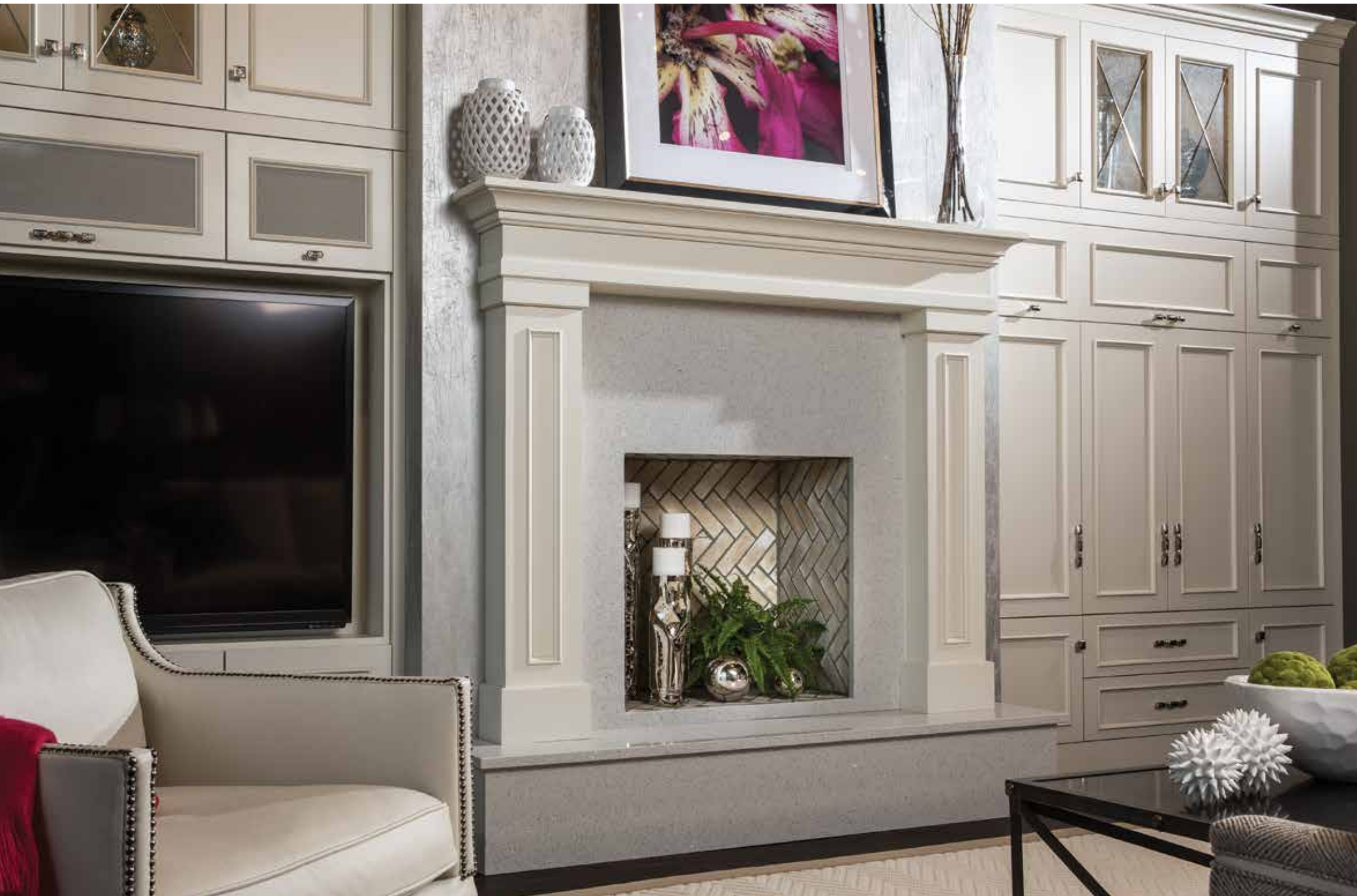
Alectra Cabinetry shown with Vintage Panel door style in Antique White/Pewter Accent painted finish with matching fireplace mantel.