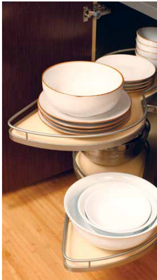
Blind Corner Swing-Out