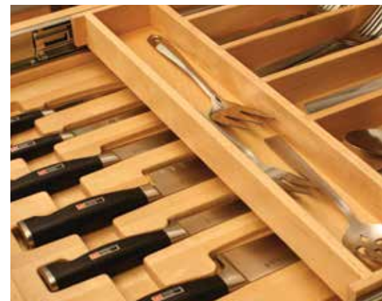
Two-Tier Cutlery Drawer

YOU'LL APPRECIATE THEIR HARD WORK! The accessories you select for your Dura Supreme kitchen are as important to the cabinet interior as the door, wood and finish are to the exterior. These hardworking, organizational tools transform your kitchen into an efficient workroom with their ingenious compartments and pull-out mechanisms. Optimize, maximize and organize every valuable inch of your storage space and then sit back, relax and enjoy your hardworking kitchen.