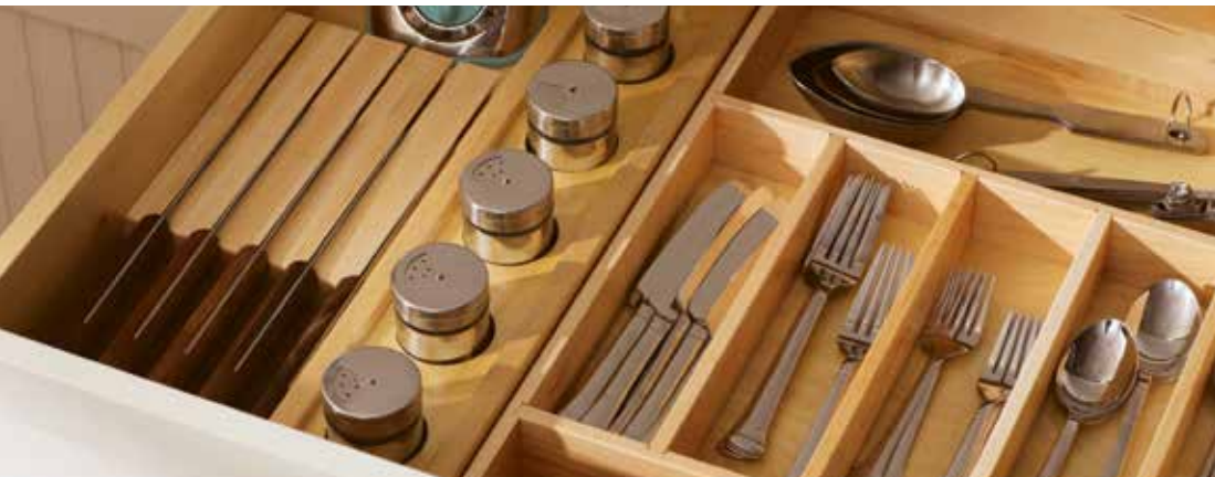
Deluxe Drawer Organizer