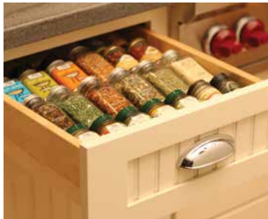
Drawer Spice Rack