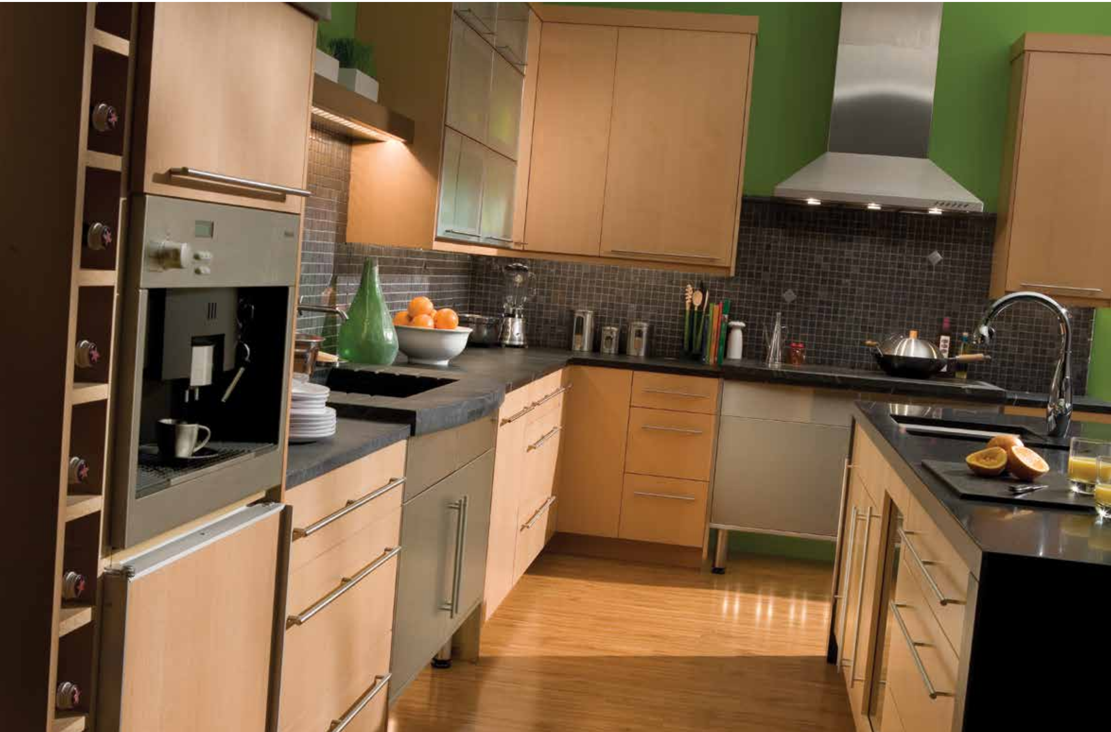
Alectra Cabinetry shown with "Metro" door style in Vertical Grain Fir with a Natural finish. Stainless Steel and Aluminum Framed doors are also shown.