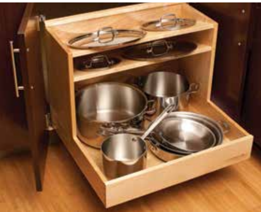
Base Pot and Pan Roll-Out