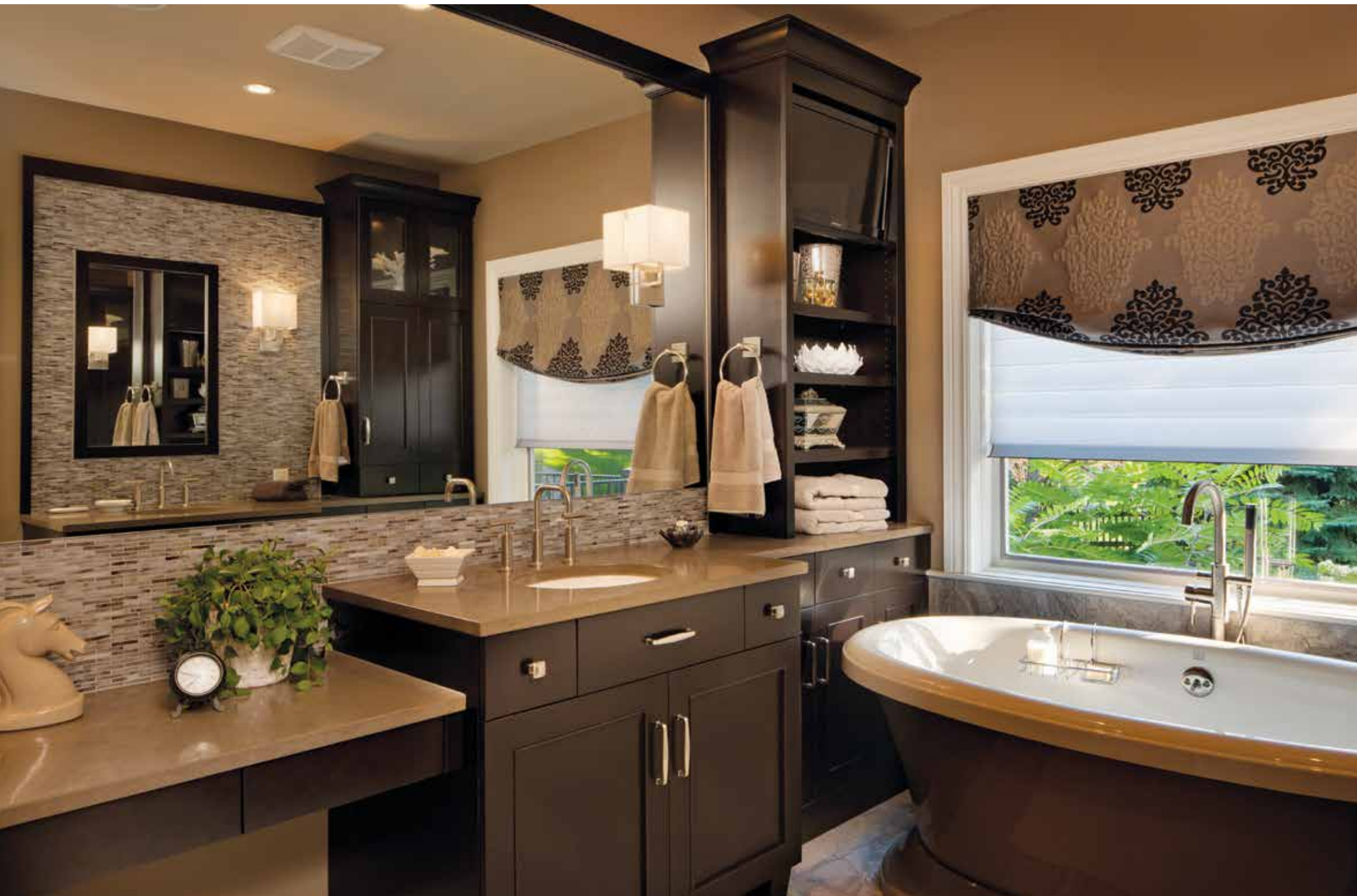
Bath cabinetry shown with "Silverton" door style in Cherry with Cocoa Brown finish.