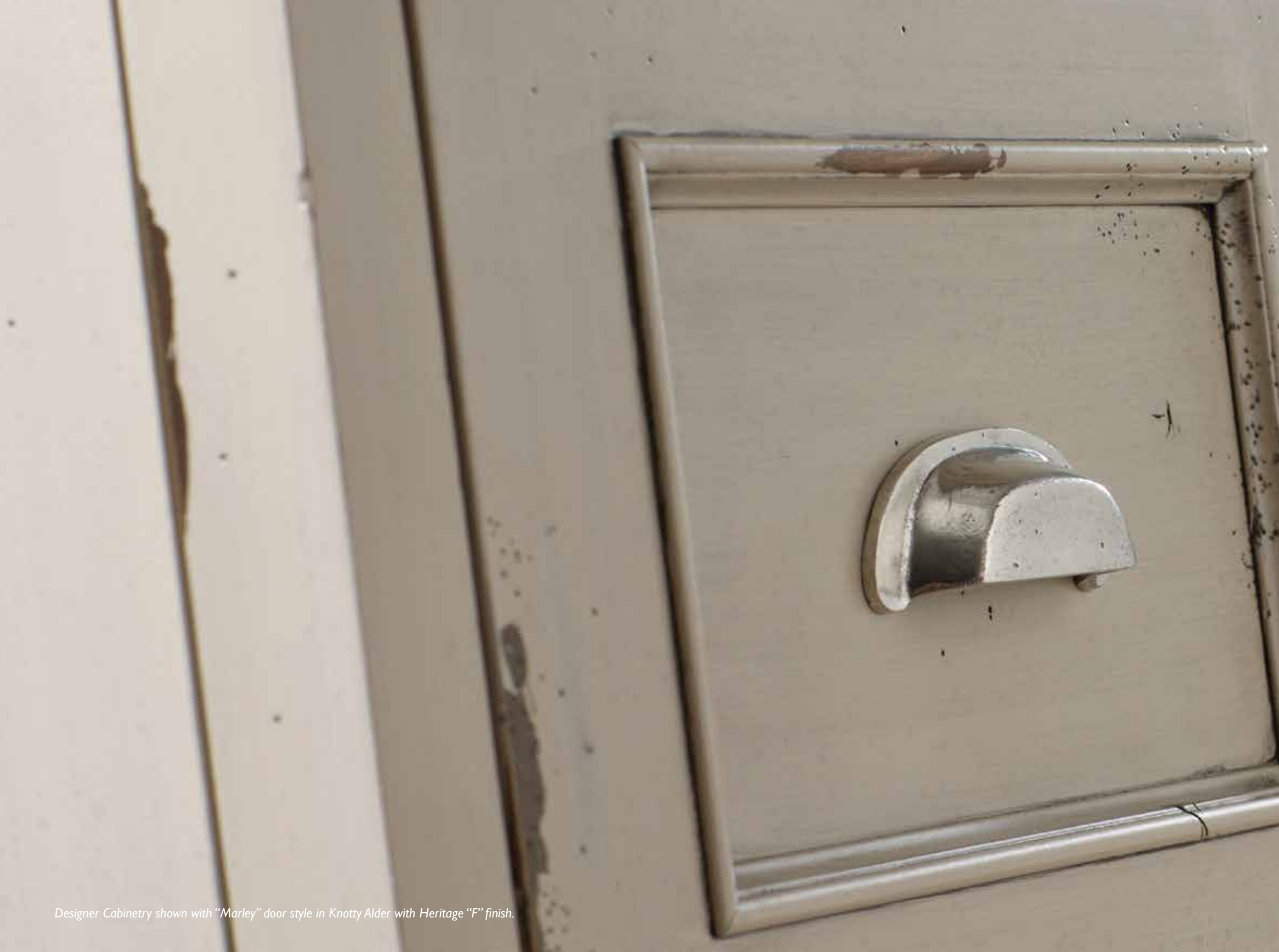
Designer Cabinetry shown with "Marley" door style in Knotty Alder with Heritage "F" finish.