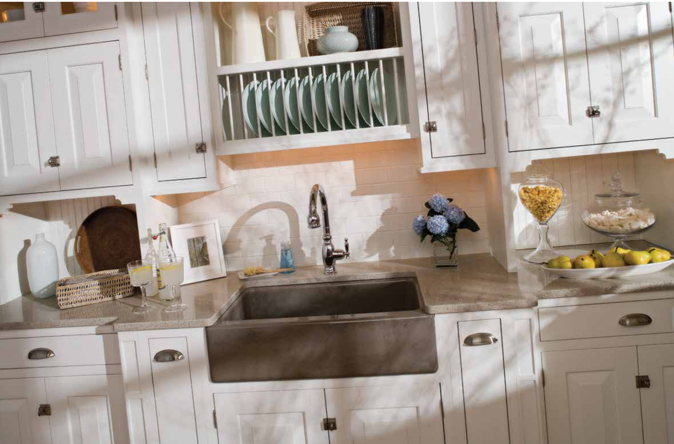
Designer Cabinetry shown with Inset styling (non-beaded frame) in Maple with White paint finish, "Bella" door style with optional Slab drawer fronts.