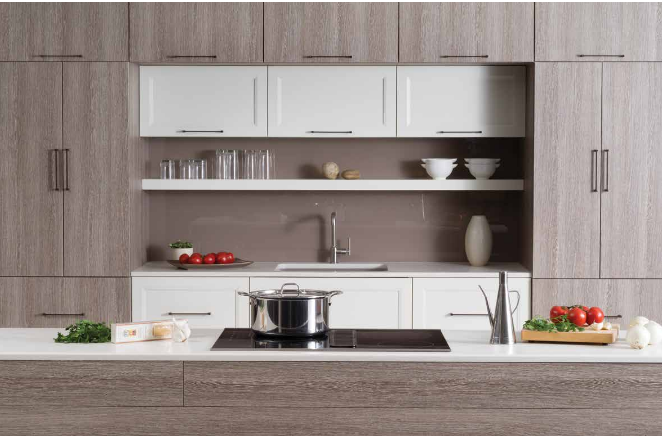
Bria Cabinetry shown with "Urbana" door style in Nutshell (Textured Foil) and "Lynden" door style in Classic White Paint.