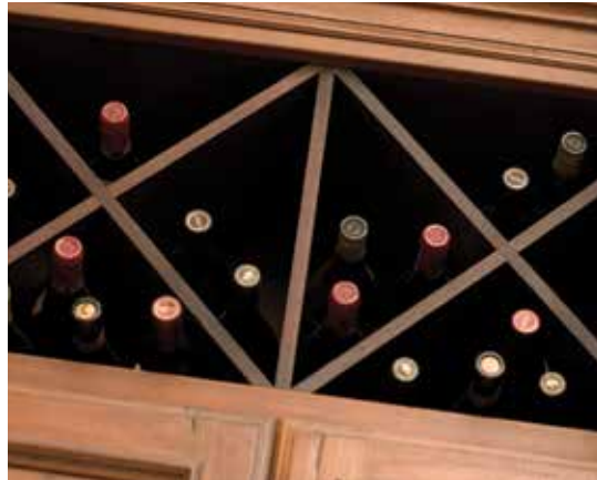
Divided Wine Rack