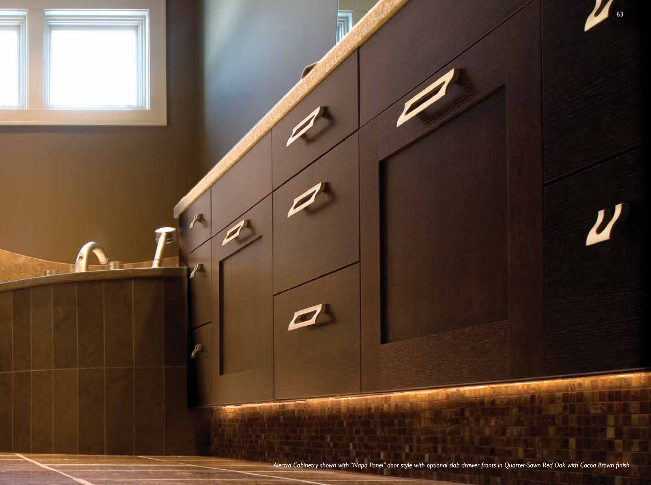
Alectra Cabinetry shown with "Napa Panel" door style with optional slab drawer fronts in Quarter-Sawn Red Oak with Cocoa Brown finish.