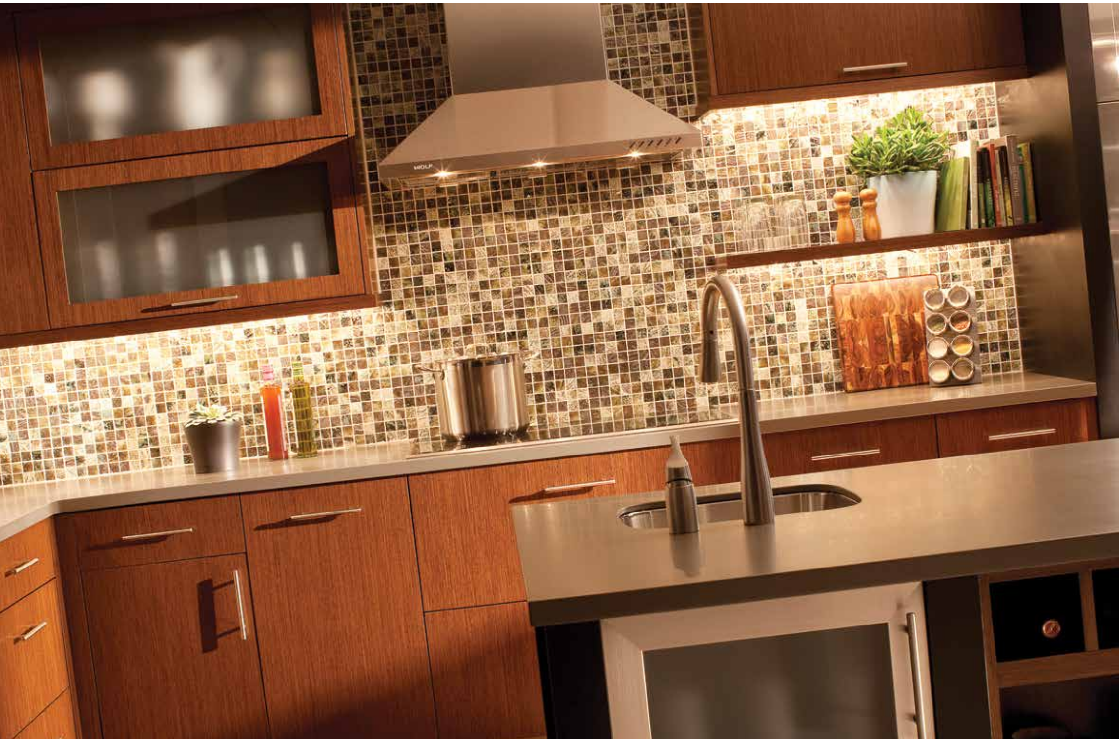
Alectra Cabinetry shown with "Moda" door style in Quarter Sawn Red Oak with Mission finish. Aluminum Frame and Stainless Steel doors also shown.