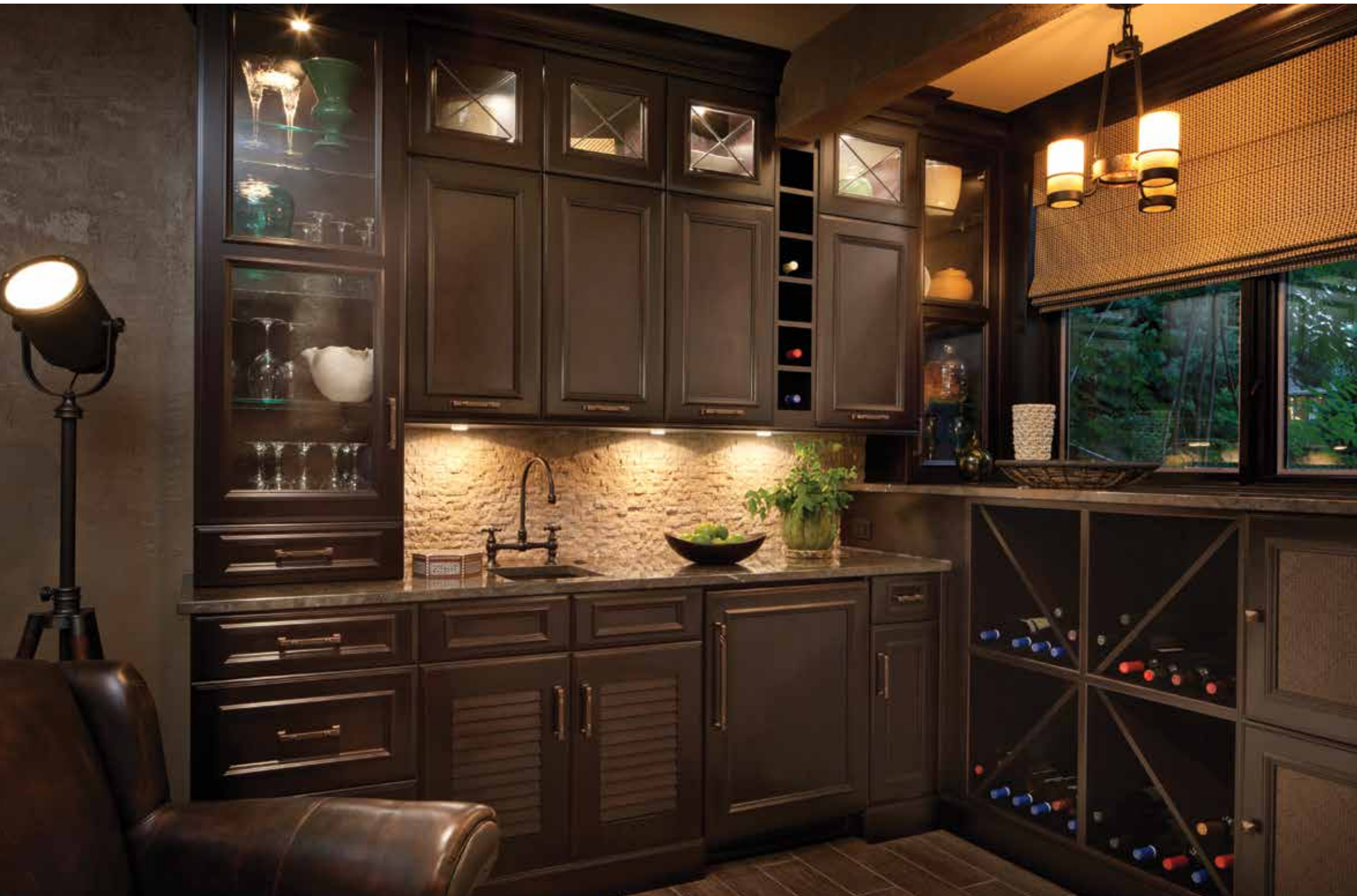
Alectra Cabinetry shown with "St. Augustine" door style in Cherry with Cocoa Brown finish. Also shown with Louvered Doors and Rattan Inserts.