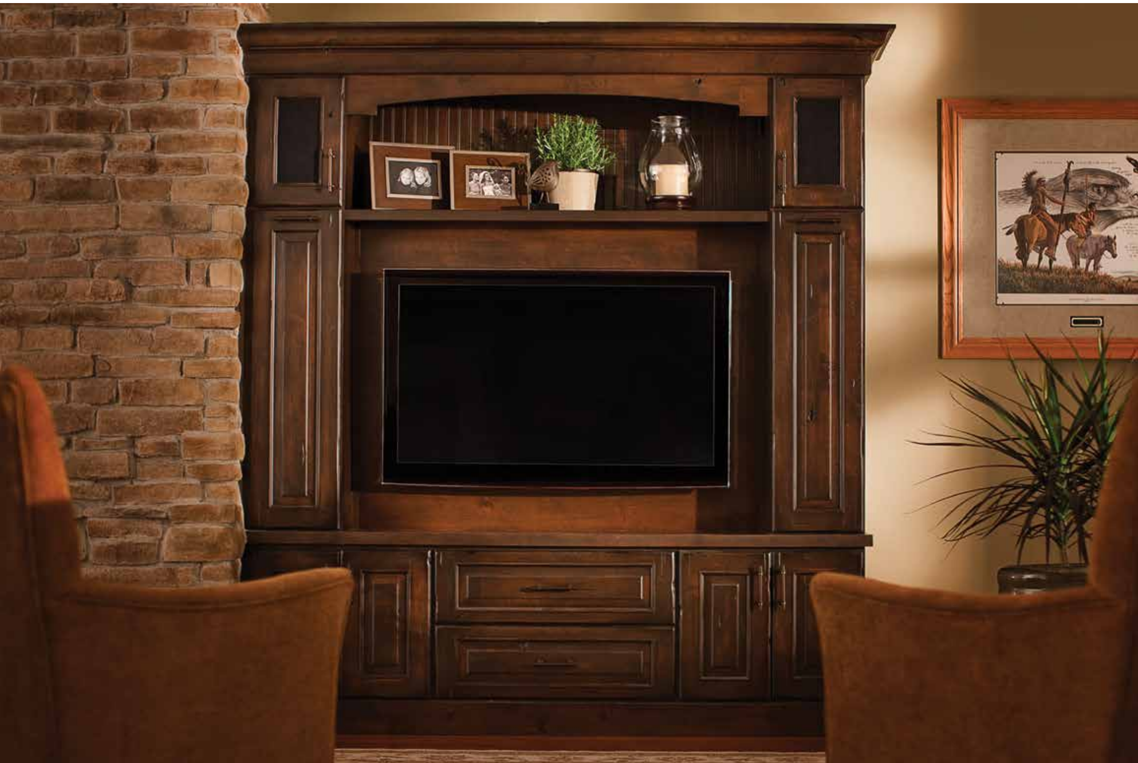
Entertainment cabinetry from Dura Supreme can be designed to integrate seamlessly with furniture and other cabinetry within the home. Shown with Montego door style, in Knotty Alder with Heavy Patina "D" finish.