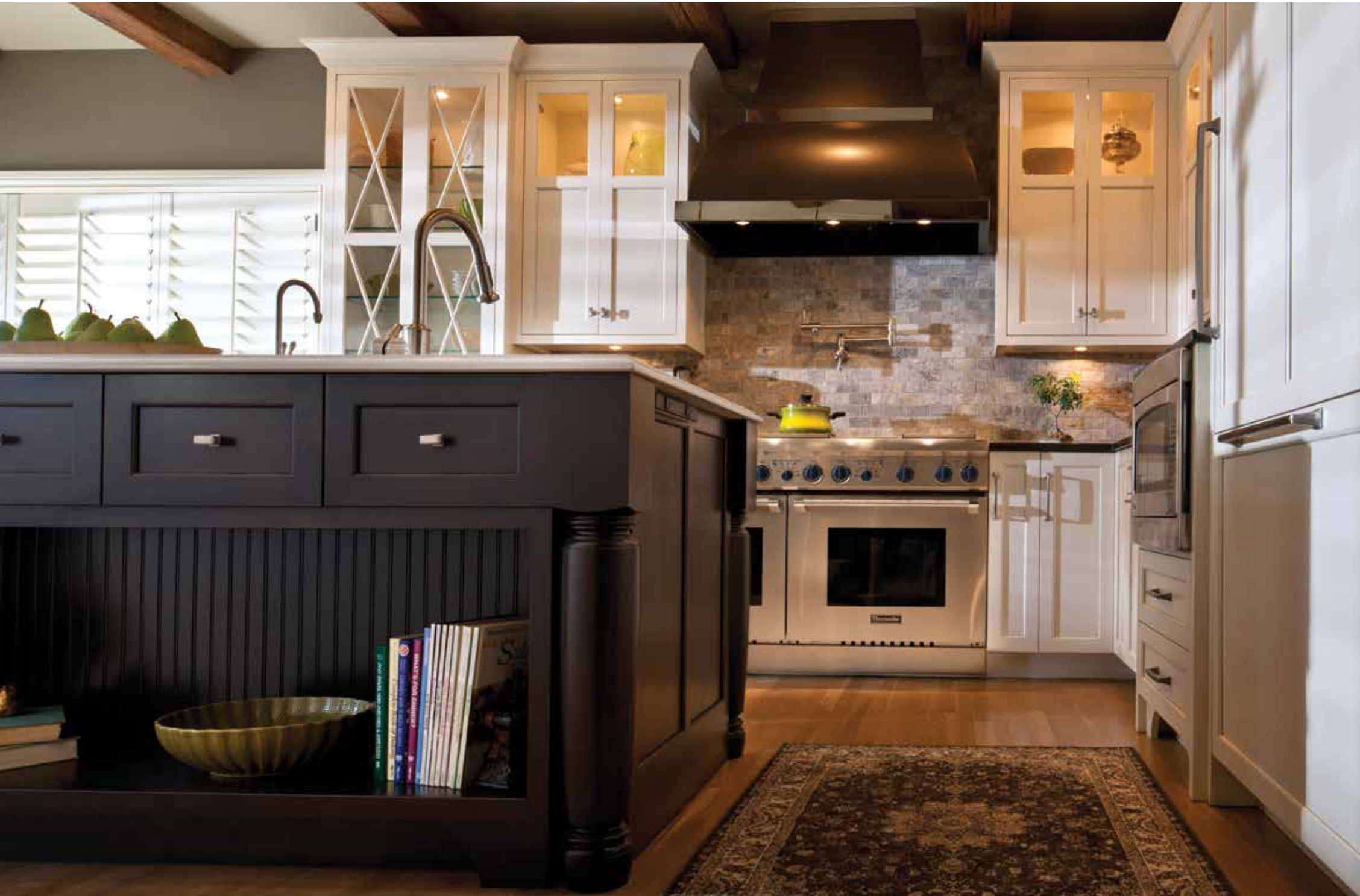
Alectra Cabinetry shown with "Arcadia Panel" door style in Classic White/Pewter Accent paint finish. Island cabinetry shown in Cherry with Peppercorn finish.