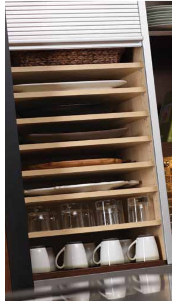
Tall Tambour Cabinet