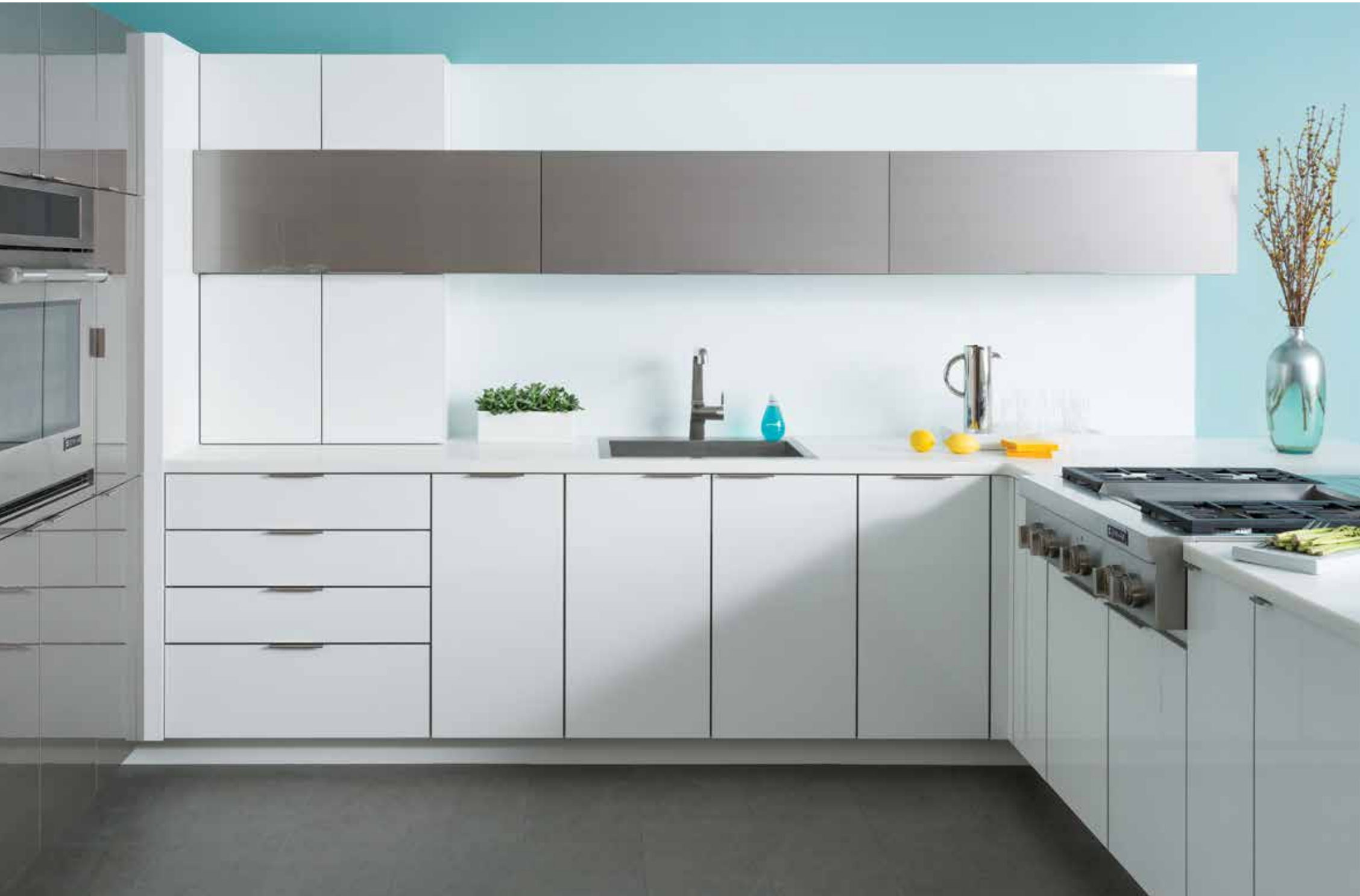
Alectra Cabinetry shown with "Ava-2T" door style in White Acrylic and "Talia-Horizontal" door style in Wired Mercury.