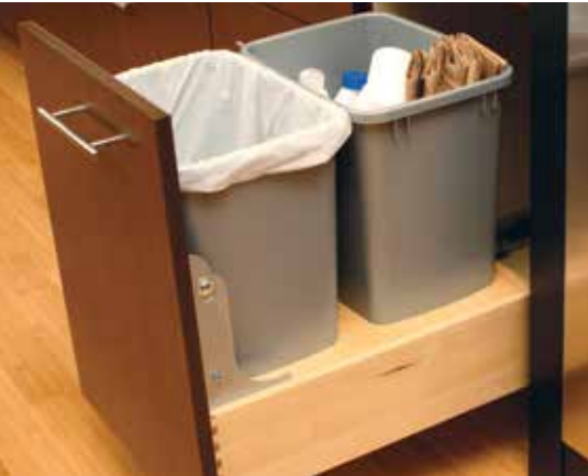
Base Recycling Center Full Door