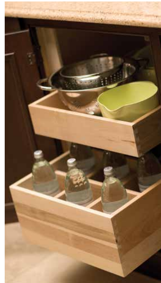
Deep Roll-Out Shelf & Bottle Rack